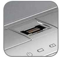
▶ Fingerprint Reader