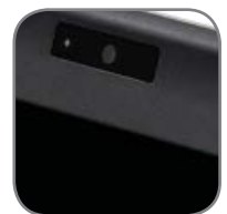
▶ 0.3 Megapixel web camera