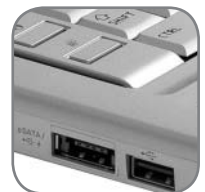
▶ USB Sleep-and-Charge/eSATA port